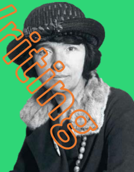
Fig. 7.1.4 Margaret Sanger

Therefore, it would stand to reason, that some varieties of humans are closer to our ape-like ancestors than others. This has been the philosophy of many dictators (Figure 7.1.3) and eugenicists (Figure 7.1.4) around the world.