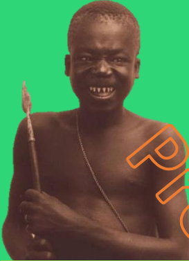
Fig. 7.1.4 Ota Benga

Perhaps the most infamous was the case of Ota Benga (Figure 7.1.4). In 1906, Ota Benga was a pygmy that was placed in an exhibit at the Bronx Zoo to show how far humanity had evolved from ape-like ancestors. Specifically, to show how similar the people of Africa were to simians.