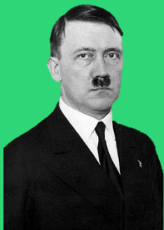
Fig. 7.1.3 Adolf Hitler

It only logically follows that some form or variety of each organism is closest to its ancestral species. For example, the Alaskan Malamute (Figure 7.1.2) is among one of the closest to the wolf, from which all domesticated dogs descended.