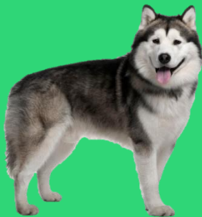
Fig. 7.1.2 An Alaskan Malamute

Since we supposedly share this common ancestor, the textbook will say that there are many transitional forms. A transitional form is a step along the evolutionary chain in which one will exhibit traits of both organisms.