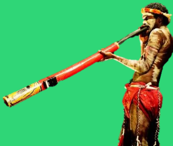
Fig. 7.1.6 A modern Australian Aborigine

Another moral atrocity was committed in Australia. European scientists found aboriginal graves and began robbing them in order to put the