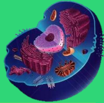
Fig. 1.1.4 A modern cell model

Scientists at the time thought that the cell was little more than a membrane with genetic material (Figure 1.1.3). We