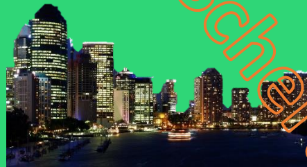
Fig. 1.1.5 A hut and a city

know that it is as complex as an entire city (Figure 1.1.5B).